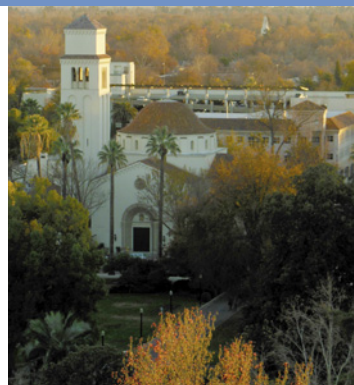
The historical Westminster Presbyterian Church, near the Sacramento Convention Center.