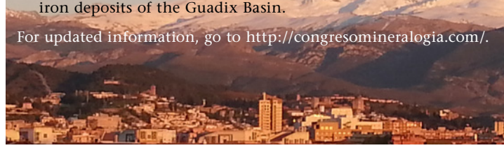
A view of the Sierra Nevada from Granada, Spain

For updated information, go to http://congresomineralogia.com/ .