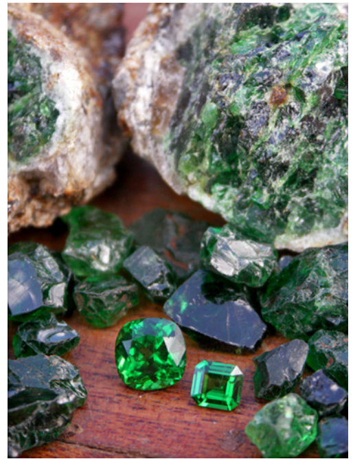
FIGURE 2 Green grossular (tsavorite) from graphitic schists at Mengare Swamp, Tsavo, Kenya.

For at least three billion years, the Earth’s tectonics have been dominated by orogenies, and cyclicity is suggested by the igneous, metamorphic, and sedimentary rock record. One apparent manifestation of cyclicity is the age distribution of igneous zircon, which correlates to the ages inferred for the assembly of supercontinents (Fig. 1). Interpreting these correlations is an area of active research and debate. One view is that supercontinents form in cyclic events and, thus, that crust growth was episodic (Bradley 2011; Voice et al. 2011; Condie and Kröner 2013). An opposite view is that gaps in the zircon record result from the different preservation potential