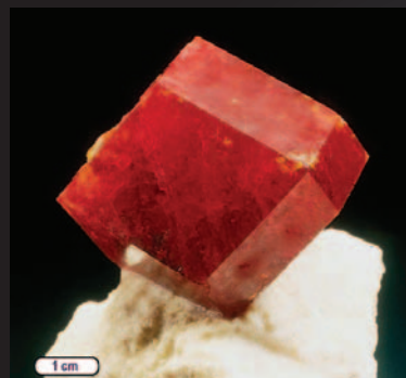
Dodecahedral grossular crystal from Sierra de Cruces, Coahuila, Mexico.

FROM our inventory of over 200,000 specimens, we can supply your research specimen needs with reliably identified samples from worldwide localities, drawing on old, historic pieces as well as recently discovered exotic species. We and our predecessor companies have been serving the research and museum communities since 1950. Inquiries by email recommended.