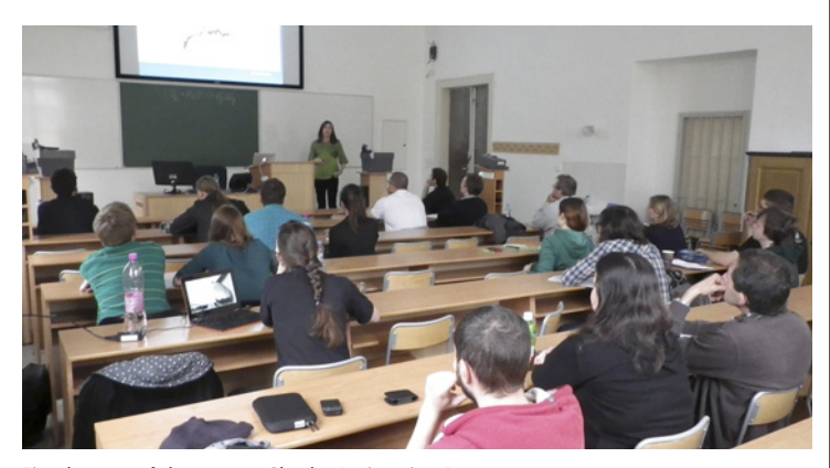
First lecture of the tour at Charles University, Prague

on the marine environment, to evaluating the utility of light stable isotopes as tracers of weathering processes. Interest in these topics was expressed by academics who specialise in subjects as diverse as biology, to environmental science and engineering, and geology.