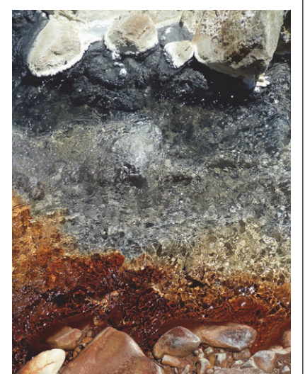
The beauty of disequilibrium.