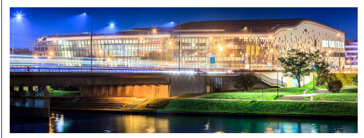
ICE Congress Center (exterior)