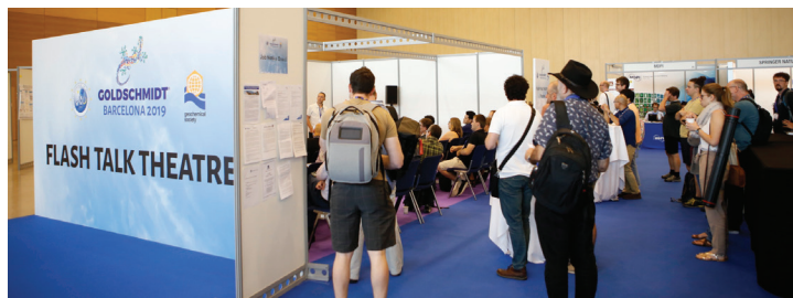
Flash talks: a new talk format introduced at Goldschmidt2019

Goldschmidt2019 introduced a new talk format: the flash talk. This is where delegates could present a snapshot of their research in four minutes, in addition to presenting a poster. There were 479 flash talks presented in the two flash talk theatres, which were located in the exhibition area. Attendance was very high from the first day and the feedback very positive. As a result, the experience will be repeated in the future.