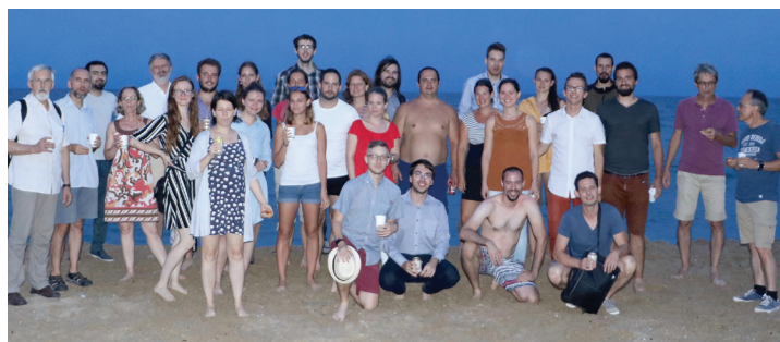
The Hungarian delegation managed to all get together on the beach!

Delegates travelled from 74 different countries, and the 15 largest delegations came from the following countries: