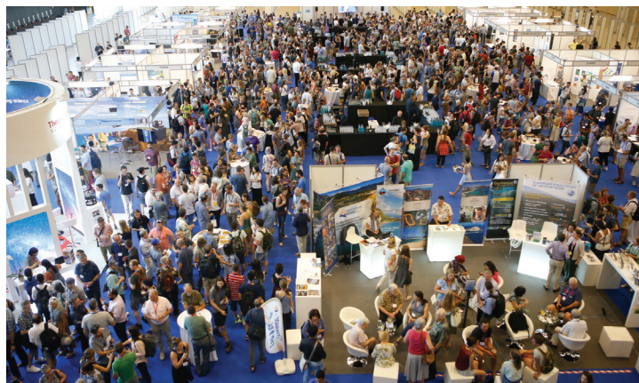
Delegates enjoying the Icebreaker Reception