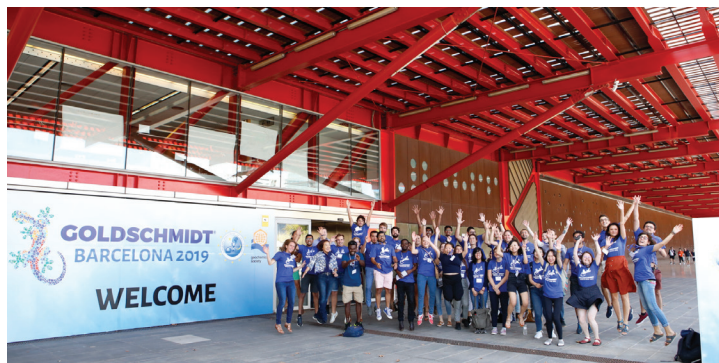
A warm welcome from the student helpers

Goldschmidt2019 was held 18–23 August 2019 in Barcelona (Spain) in the beautiful Centro de Convenciones Internacional de Barcelona, located near the beach, which many delegates enjoyed (and to which some groups even managed to get pizzas delivered!). Nearly 4,100 delegates participated in the six-day meeting, making Goldschmidt2019 the third largest Goldschmidt conference, after Paris in 2017 and Florence in 2013. Student representation reached 32%, significantly up on the 25% in 2013.