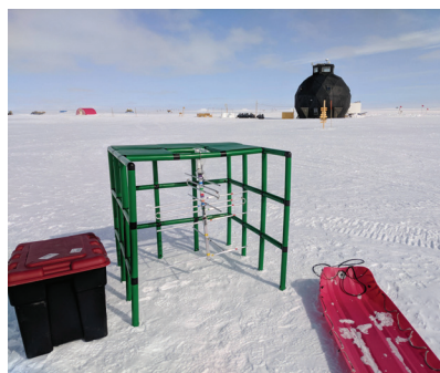
The 'Cryoegg' receiver and frame in the field.

"We love to repurpose household items for science, and when conducting fieldwork in remote polar environments, we've become experts at adapting whatever equipment we can find. Our best example from the last field campaign in Greenland was the use of a kid's climbing frame to hold our antenna. We're developing an instrument to measure water beneath ice, to understand the microbial and geochemical environments and assess