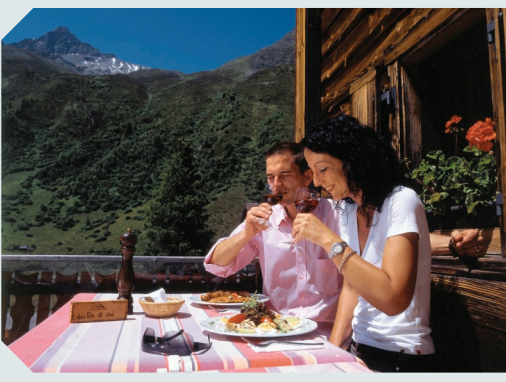
There are nearly 100 restaurants serving Swiss and international cuisine.