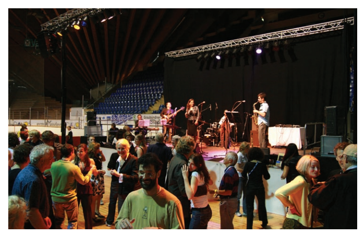
Dancing at the conference dinner takes over the stage.

The well-attended Sunday icebreaker featured live music provided by Double Scotch, a band of geochemists from CRPG, Nancy, whose rock covers were particularly popular with younger delegates. The conference dinner on Wednesday was attended by 1120 people and held in Davos' Valliant Arena, the ice stadium also used for the poster displays. The catering company provided an outstanding selection of Swiss local specialities, in volumes sufficient to satisfy the hungriest. Live Brazilian jazz music and a DJ got many on their feet, resulting in a stage full of dancing bodies that only cleared when the music stopped at 1 am. Other social events were also popular, with alpine views, high dining and a sell-out glacier restaurant train attracting 370 delegates to three smaller events.