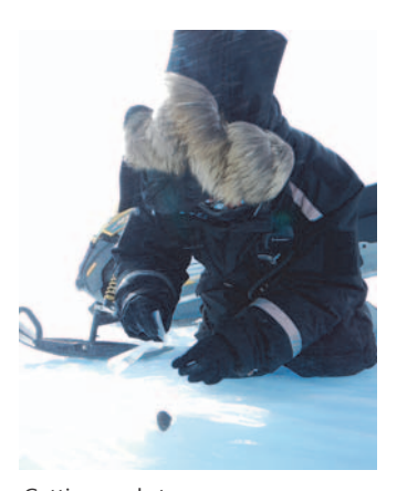
Getting ready to scoop up a large meteorite