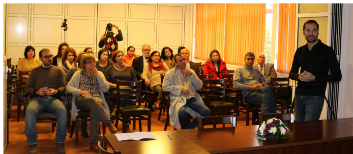
The attentive audience at the Institute of Biology, Romanian Academy

I had the good fortune to be part of the 2016 EAG Distinguished Lecture Program. My research interests lie at the interface between chemistry and biology, and I have always enjoyed interacting with researchers from these disciplines. I am a biologist by training but work on the biogeochemical processes of cold environments. Sometimes, I use biological techniques and sometimes more chemically-oriented approaches to determine the magnitude of carbon and nutrient cycling on glaciers. The EAG lecture tour was an excellent opportunity to interact across the disciplines, and I went to institutes that focus on geochemistry – Kiev (Ukraine) and Krakow (Poland) – or on biology/microbiology – Bucharest (Romania) and Ljubljana (Slovenia). At each place, my goal was to engage microbiologists with geochemists. On top of that, it was a great opportunity for me to see a side of Europe that has a rich history. The airline gods were certainly in favour of the tour. Travelling back and forth between four different destinations in 9 days meant boarding 10 different planes and using 5 different airline companies in a short period of time. Except for one harmless small delay between Belgrade and Ljubljana, every single flight was bang on time, making the whole trip really smooth.