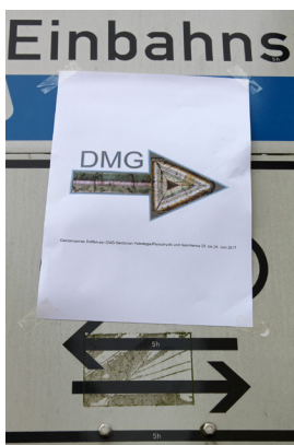
Due to the trigonal tourmaline arrows no participant got lost.