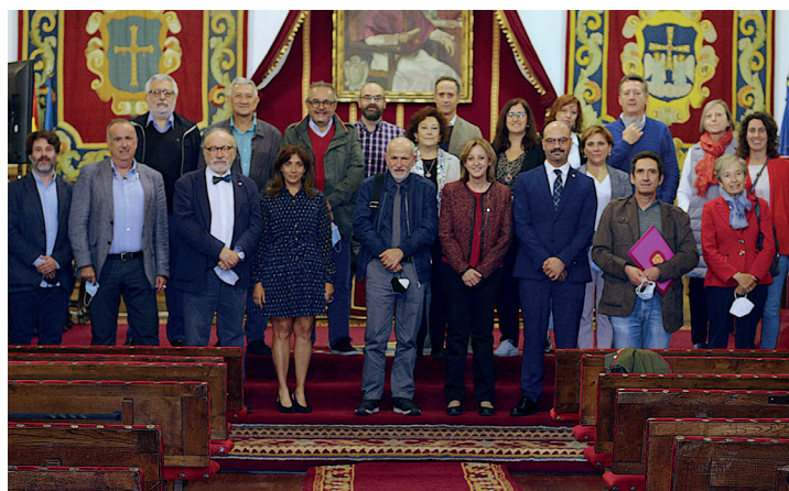
Participants on site after the ceremony.