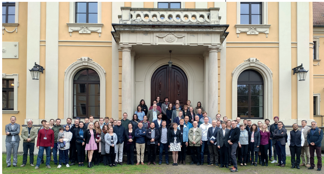
Participants of the 27 th Meeting of the Petrology Group of the Mineralogical Society of Poland.

The 27 th Meeting of the Petrology Group of the Mineralogical Society of Poland was organized by the Institute of Earth Sciences at the University of Silesia in Katowice. The session was held from 20 to 23 October 2022 at the Cistercian Monastery and Palace Complex in Rudy.