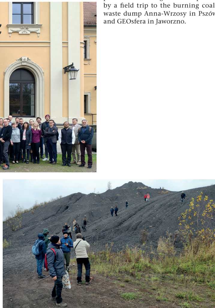
Field trip to the burning Anna-Wrzosy dump in Pszów.