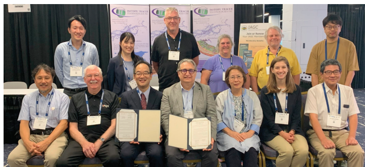
Society members celebrate the signing of the IAGC and GSJ agreement.

is founded on the promotion of scientific research, international engagement, and collaboration across societies. The IAGC is excited to support GSJ in scientific activities, and the two societies celebrated the official signing of the agreement at the conference!