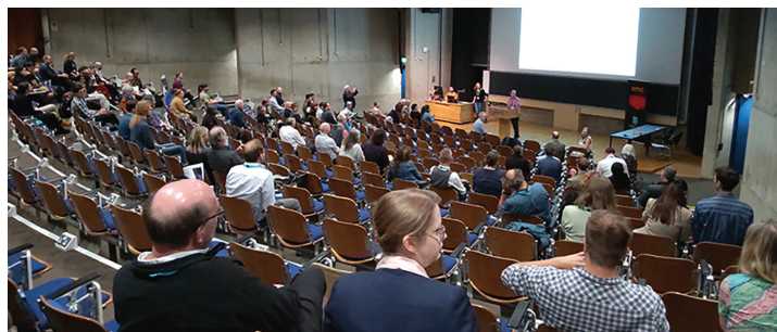
FIGURE 4 Closing ceremony of the EMC 2024 meeting.