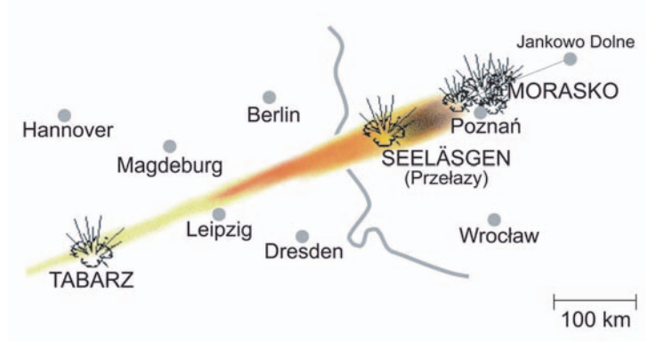
FIGURE 1 Location of the Morasko and paired irons in Central Europe (modified after Czajka 2005)

related, irons of Przełazy (Seeläsgen), Jankowo Dolne, and Tabarz (Fig. 1). Chapter 3, Iron Meteorite Shower Morasko, Przełazy, Jankowo Dolne, outlines the geological setting and provides field observations on the Morasko craters and the reconstructed strewn field. It also reviews ideas concerning the fall, including the favored hypothesis of a single, large iron meteorite shower. The following four chapters summarize the geochemistry, petrology, mineralogy, and Raman